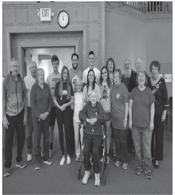
Seniors from Sidney High School stopped by to play a rousing round of Chair Volleyball. Fun was had by all!